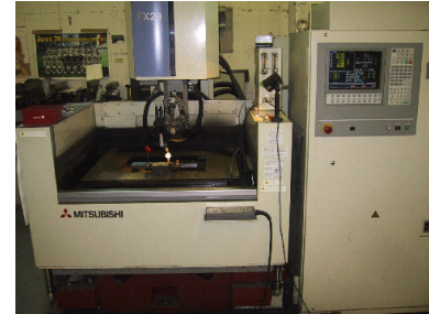
Spark erosion machine (insulation from passive vibration)